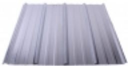
Galvalume Sheet Steel

Easily processed cold, welded, beamed, deep-drawn or painted and it safely protects the product it contains. Material that can be completely recycled. [Product Details...]