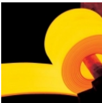
Hot rolled coils and plates

55% Al-Zn coated sheet steel product suited for most types of roofing and siding applications as well as unexposed automotive parts, appliances and miscellaneous applications like furniture, outdoor cabinetry, pipe, etc. [Product Details...]